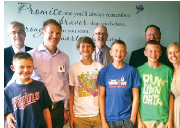
Nemeth Family Playroom