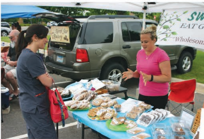
Offering gluten-free products