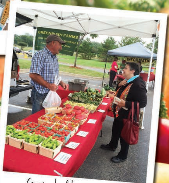
Growing healthy communities