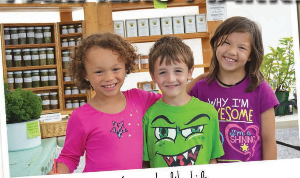
Growing healthy kids