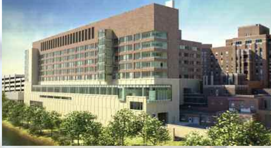
Future look of St. Cloud Hospital from riverside