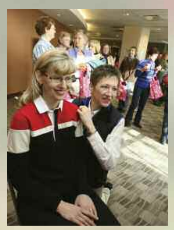
Local women participate in video otoscope evaluation of the ears at Women's Health 101.